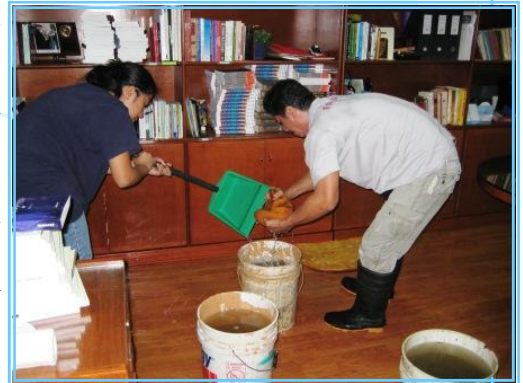
Students and staff worked side by side

I am waiting for a technician to inspect the plug that shot out electrical sparks and blackened soot when we unplugged an extension cord. Since my office has no windows, mould is a high concern to me. We are using the air conditioner to remove moisture and a fan to circulate air. The wooden flooring that had been under water has now begun buckling slightly at the joints and may need to be replaced. We are thankful God helped us discover the water problem so early, preventing greater damage at APNTS.