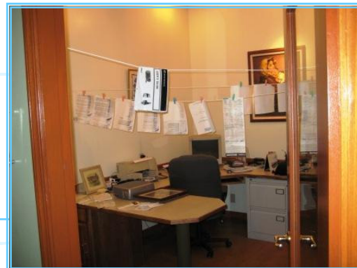
Naomi Phillips decided to hang important papers on lines to dry